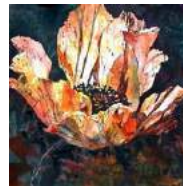
Tape Batik with Watercolors on Yupo: Sandy Maudlin June 6 - 8, 9:30AM - 5:00PM $ 295.00, sandymaudlin.blogspot.com