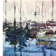
Painterly Watercolors: Eric Weigardt May 16 - 19, 9:00AM - 4:00PM $ 525.00, ericwiegardt.com