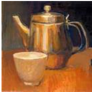
Paint Like the Old Dutch Masters with Acrylic: Wayne Jiang April 19 - 22, 10:00AM - 5:00PM $395.00, waynejiang.com