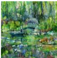
Rice Paper and Watercolor Batik: Kristie Mooney April 27 - 29, 9:30AM - 4:00PM $295.00