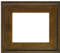
Acceptable plain, simple framed: